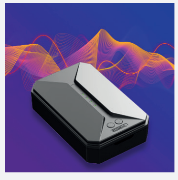
Buzer Alarm to remind when fnishing disinfection