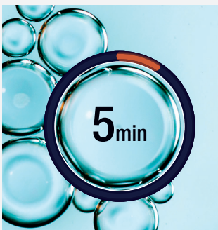
5 minutes to get your belongings sanitized