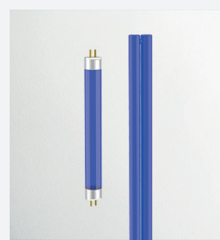
High quality lamp