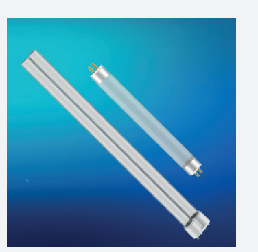
Quartz glass tube Allows full transmission of ultraviolet light