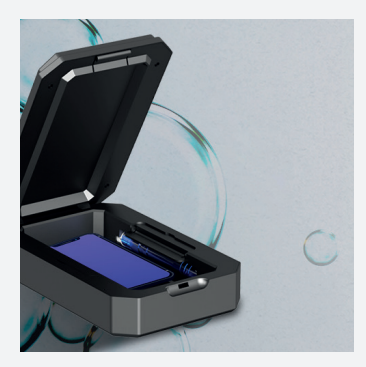
No Ozone Safe and harmless – Leave no residue Note: Only when used in accordance with manufacturer instructions